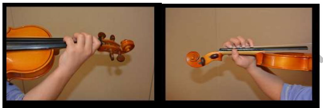
Figure 3..Left hand position

The left arm, wrist and fingers determine the left hand position. While holding the violin, the wrist should be relaxed and it should be positioned in the way that it faces the violin. The fingertips should press the strings upright but by not putting too much pressure on them.